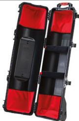
* tri version