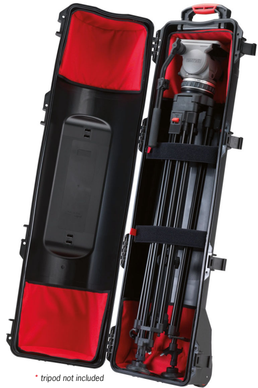
* tripod not included

* open cases images reflect the different HPRC cases internal options