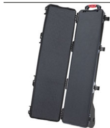
* cubed foam